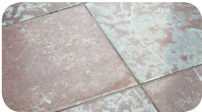
DIRTY, STAINED GROUT LINES