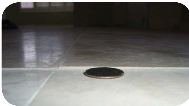
LIPPAGE (UNEVEN TILES)